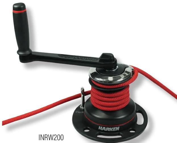
INRW200 Riggers Winch 200

A: Yes; servicing and maintenance of the winch should be carried out in accordance with the Harken service instructions and only using Harken approved replacement parts and consumables.