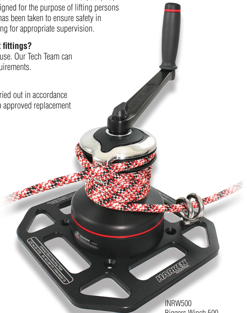
INRW500 Riggers Winch 500

For more information please visit the website, www.harkenindustrial.com or contact us on +44 (0)1590 689122 or info@harkenindustrial.com